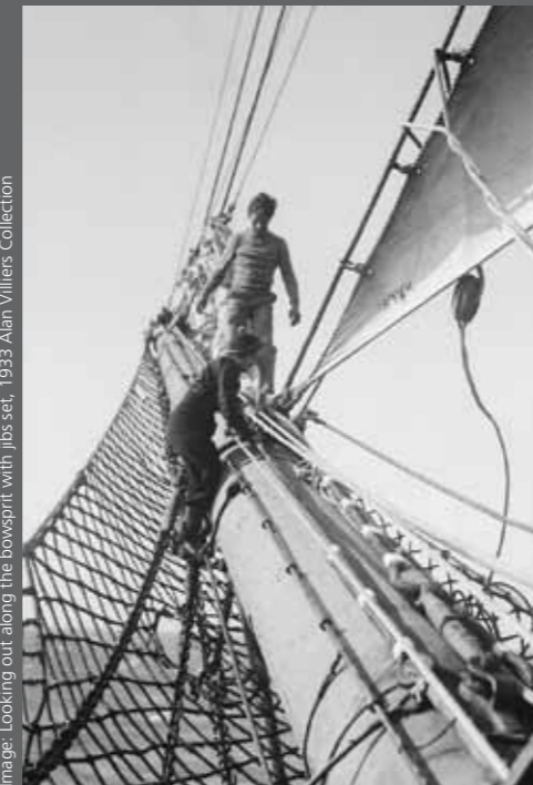
Image: Looking out along the bowsprit with jibs set, 1933