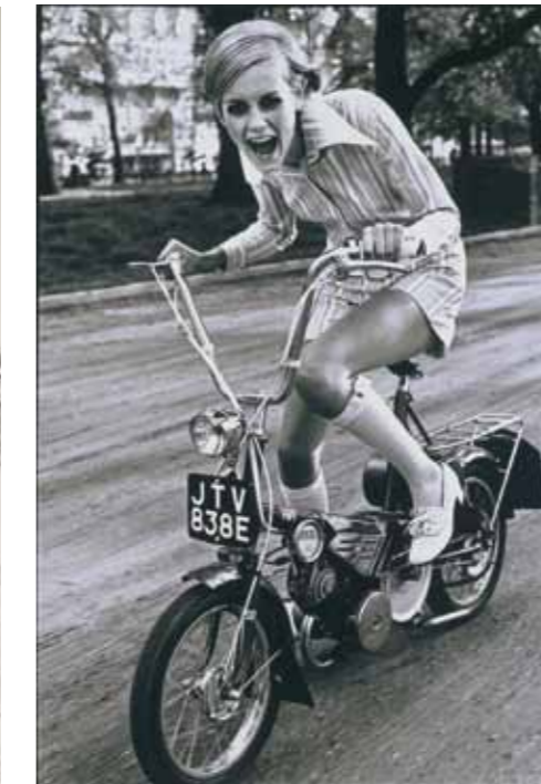
Image: Twiggy wears Twiggy Dresses Battersea Park, London. Unpublished Fashion Study for British Vogue, Young Idea 1967

Exhibition organised by the Victoria and Albert Museum, London.