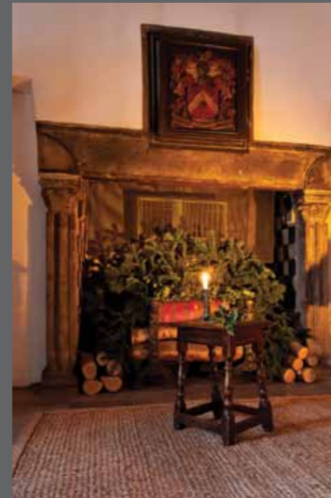
Image: Fireplace in the Great Hall at Provost Skene's House

To celebrate the holiday season we are offering a series of Christmas Craft workshops. We will tour this impressive building which always looks at its best adorned with festive decorations, to explore Christmas traditions from the past. Pupils will then make their own decorations to take back to school.