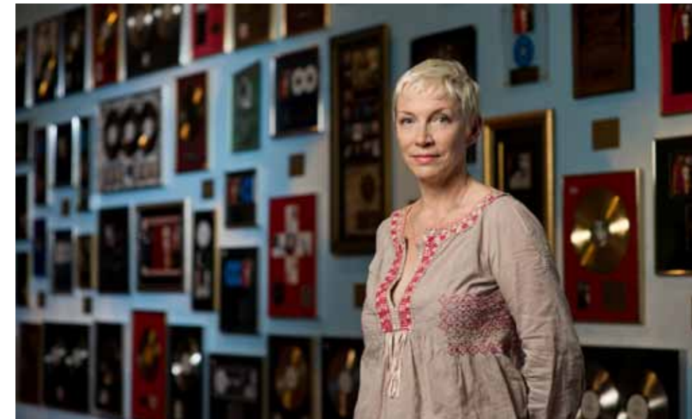
Image: Annie Lennox pictured at Aberdeen Art Gallery (detail).

Exhibition organised by the Victoria and Albert Museum, London.