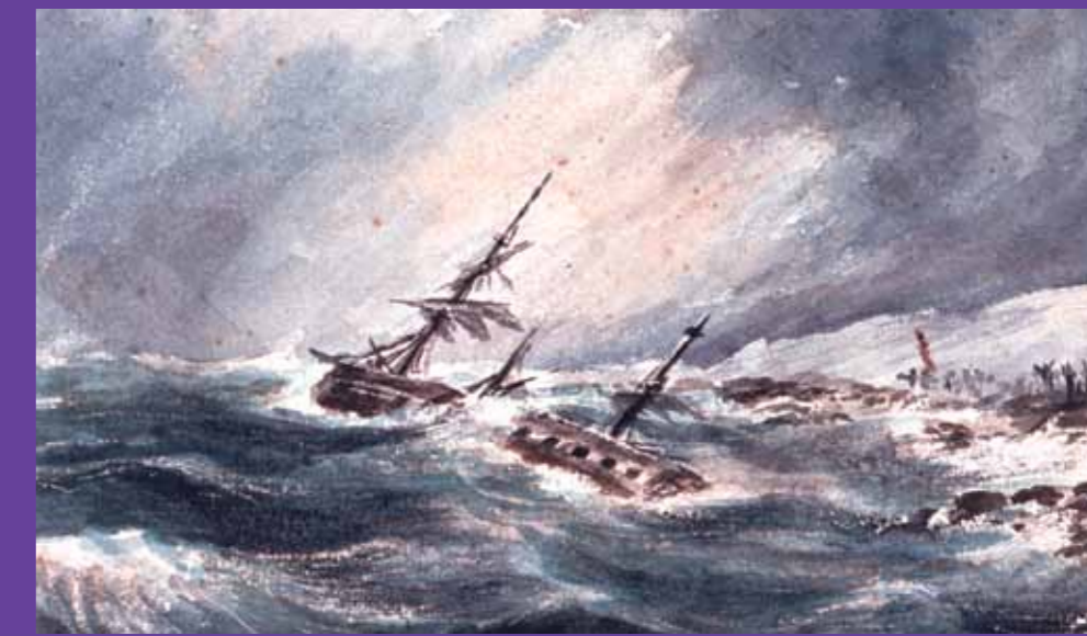
Image: Wreck of the Oscar, 1st April 1813

Travelling anywhere by sea has always been fraught with dangers and even with the high tech safety equipment available today, disasters still happen. To coincide with the exhibition on the bicentenary of the wreck of the whaling ship the Oscar, this workshop looks at all aspects of safety at sea.